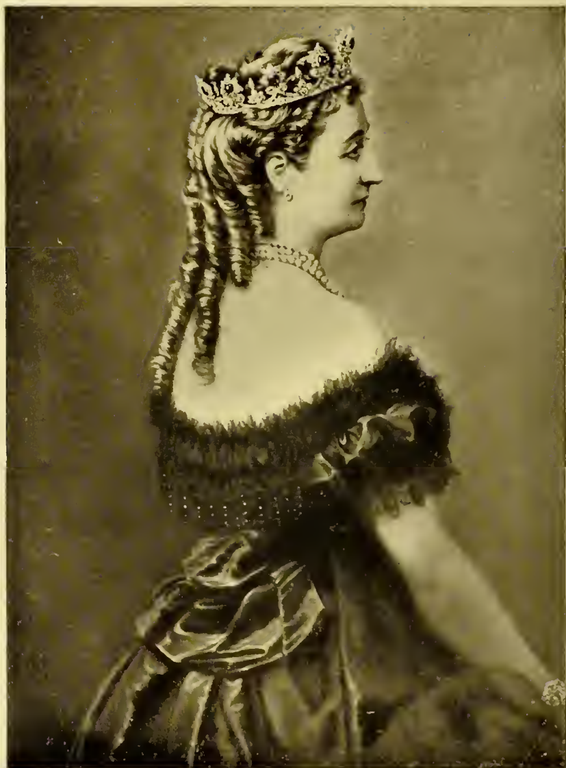
THE EMPRESS EUGÉNIE. From a photograph taken about 1865.